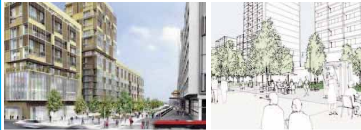
Artist's impressions of what the centre of Dalston could look like after regeneration