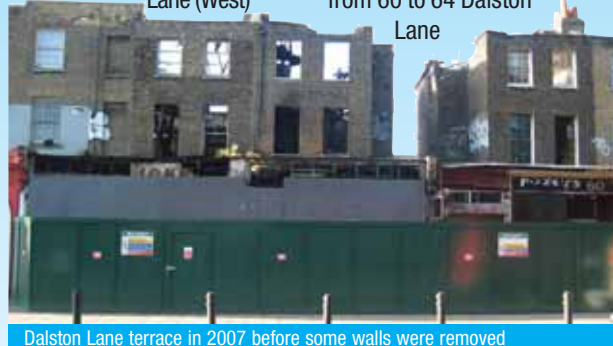
Dalston Lane terrace in 2007 before some walls were removed

Many of the 19th century properties, part of the Dalston Lane (West)