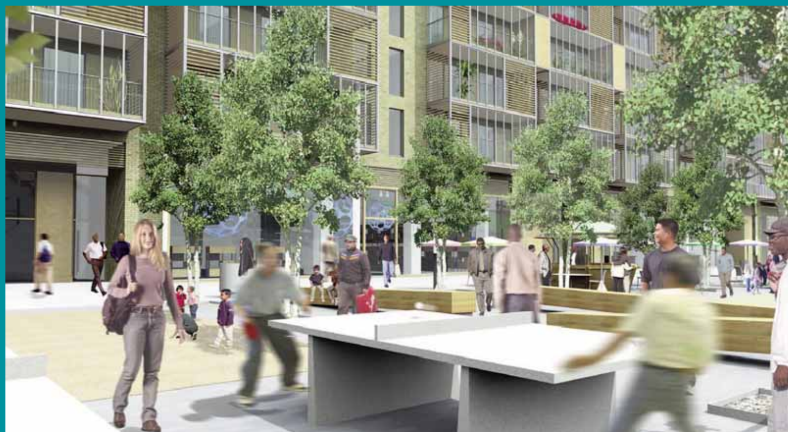
An artist's impression of how the Dalston Square development might look