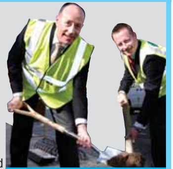
Mayor Pipe and Cllr Laing dig in

Mayor Jules Pipe pledged to carry this out by 2010,